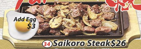
34 Saikoro Steak $26 Grass Fed Scotch Fillet