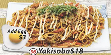
36 Yakisoba $18