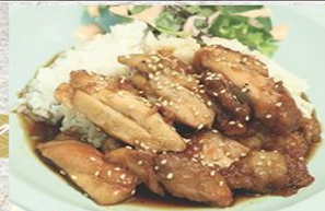
39 Teriyaki Chicken with Rice $19