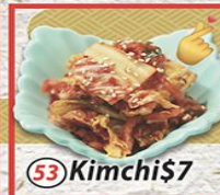
53 Kimchi $7