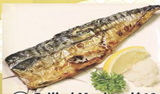
46 Grilled Mackerel $12