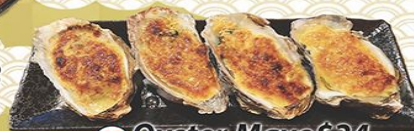
42 Oyster Mayo $24