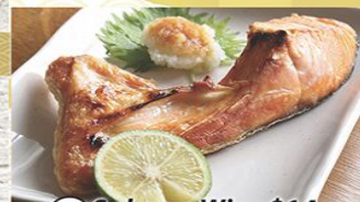
45 Salmon Wing $14