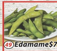
49 Edamame $7