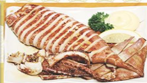
44 Grilled Squid $26