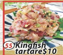
55 Kingfish tartare $10