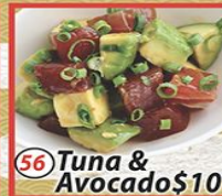
56 Tuna & Avocado $10