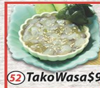
52 Tako Wasa $9