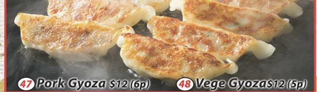
47 Pork Gyoza $12 (6p)