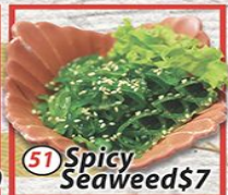
51 Spicy Seaweed $7