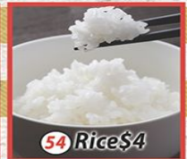
54 Rice $4