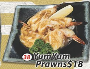
38 YumYum Prawns $18