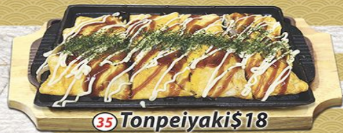
35 Tonpeiyaki $18 Prawn, Cheese, Mushroom & Onion Egg Roll