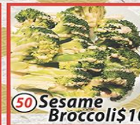
50 Sesame Broccoli $10