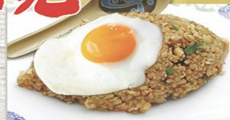
43 Egg Fried Rice $15