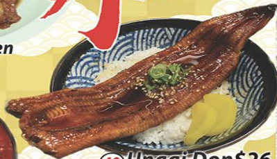
40 Unagi Don $26 Teriyaki Eel on Rice