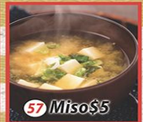
57 Miso $5